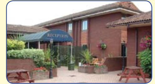
Thistle Hotel East Midlands Airport

The programme for this year's NACO Annual General Meeting is taking shape.