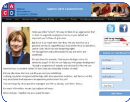
NACO's new website naco.coop

We'll be working hard to keep these issues at the top of our agenda. Of course, NACO does much more than this – if you need help or advice, get in touch with one of our officials and see what we can do for you.